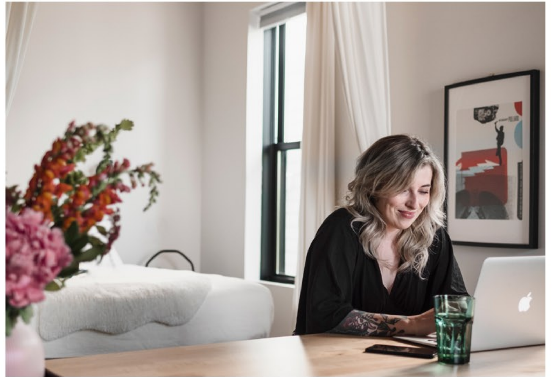
Above Left : Branding Session - Bloom + Wander Above Right: Branding Session - Locks & Mane Right: Advertising Content - Brewery Park Hotel