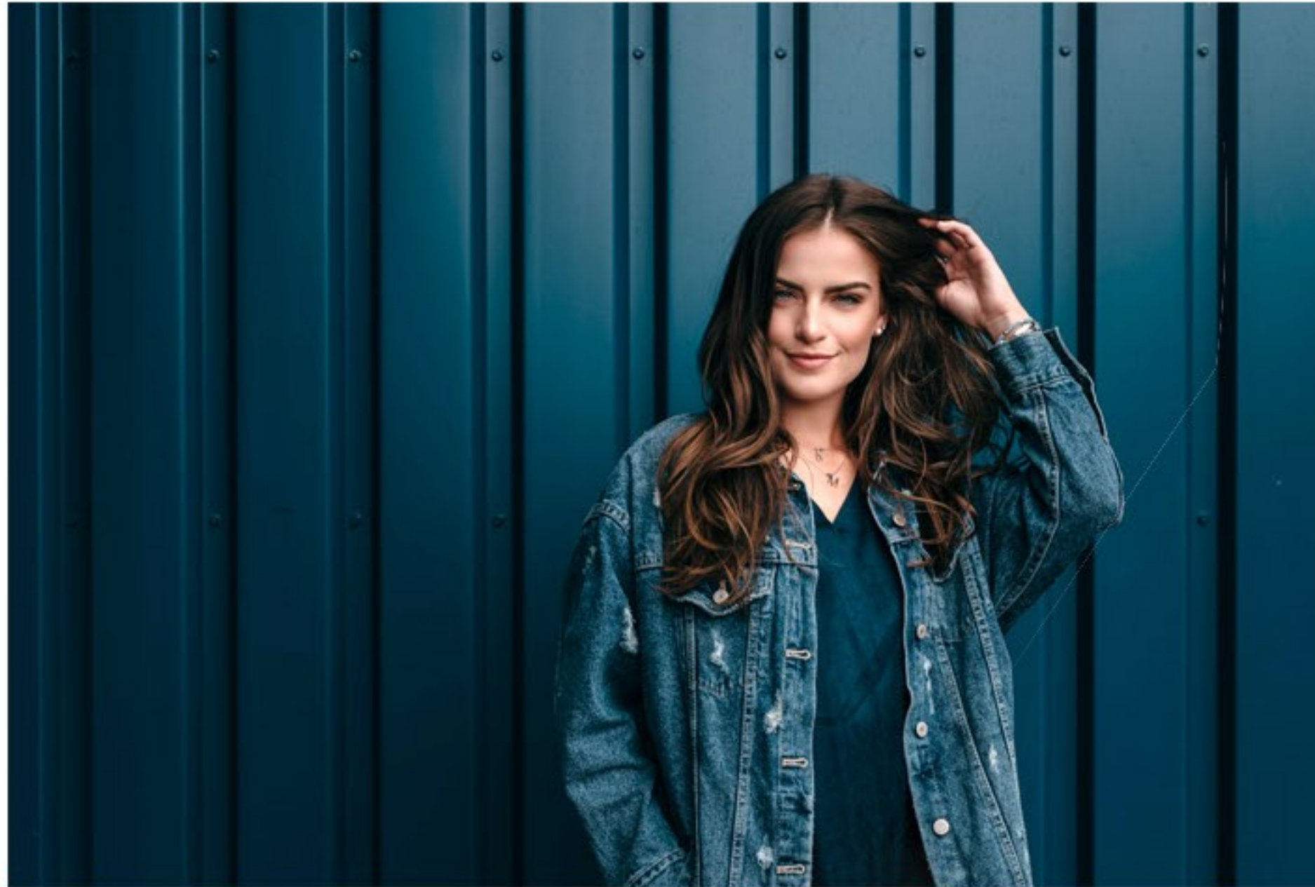
Above, Right: Best New Music Cover - The Coast