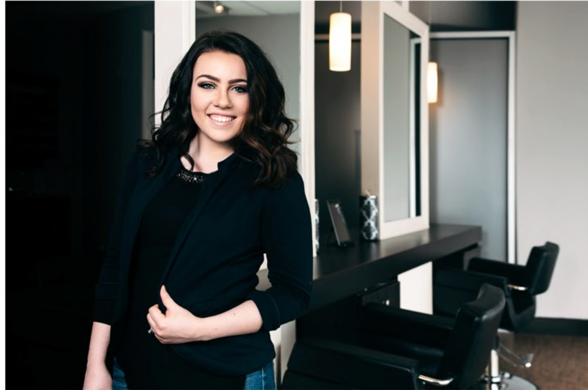
Above: Stylist Portraits - Salon Resource Group Right: Look Book - My Home Apparel